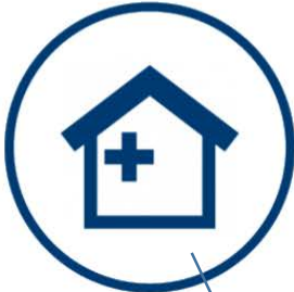
Places Hospitals, clinics, labs, imaging centers

Click the People icon to find a provider