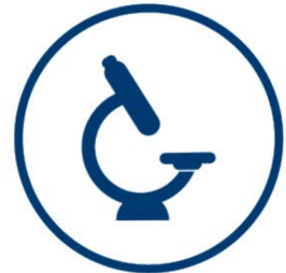
Tests and Images

Hospitals, clinics, labs, imaging centers