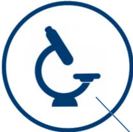
Tests and Images Lab tests, screenings, X-rays, scans

Click the Places icon to find a facility