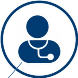
People Doctors and other professionals by specialty

Click the People icon to find a provider